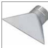
Item No. 4021 Wide slot nozzle 150 x 1 mm, for model 3000, 3000E