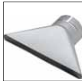
Item No. 4022 Wide slot nozzle 150 x 10 mm, for model 3000, 3000E