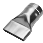
Item No. 4030 Wide slot nozzle 70 x 10 mm