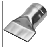
Item No. 4031 Wide slot nozzle 70 x 4 mm