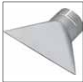
Item No. 4021 Wide slot nozzle 150 x 1 mm, for model 3000, 3000E