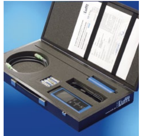
High quality wooden case and PT100 ceramic sensor are included in delivery