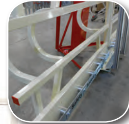
New Frame Design