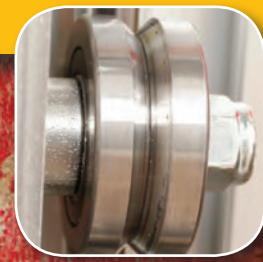
Dual V-track & Bearing