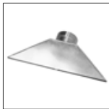
Item No. 4024 Wide slot nozzle 300 x 5 mm, for model 7500