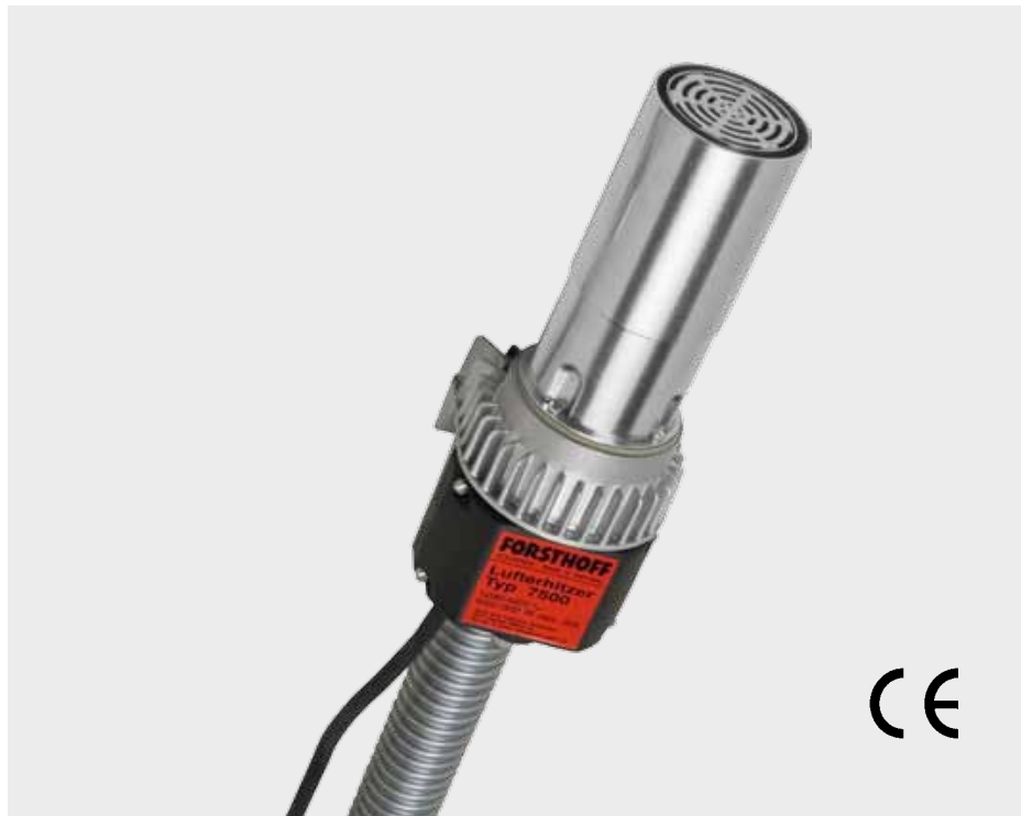
FORSTHOFF air heater model 7500