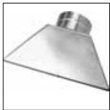
Item No. 4023 Wide slot nozzle 200 x 5 mm, for model 7500