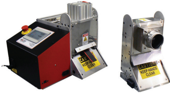
Model shown: ARX200GSLXEK 6" Auto Guillotine cold-cutter with interchangeable SCL Hot Knife cutting module.

Automatic alternating angle hot knife with 5"/130mm hot knife (SCT) with digital/PID temperature control 120V or 230VAC, and power plug for any country.