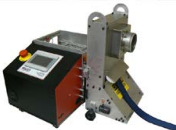
Model Shown: ARX240SCLDEK 5" (130mm) Hot Knife with tubular cutter