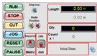
NEW GEN 2 Touchscreen Controls