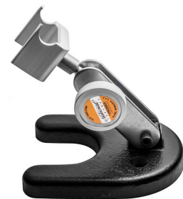
Flame Polishing Torch Stand $60 TS191

Abbeon Cal, Inc. 1363 Donlon Street, Unit 1, CA 93003