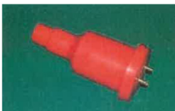
E3- HF Spule HF Coil