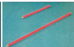
E9- Verlängerungsstange 200 mm Extension rod 200 mm