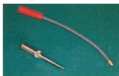
E5- Stabelektrode Flexible Probe