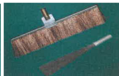
E8- Kupferbürstenelektrode Copper brush electrode