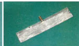
E4- Gazelektrode Gauze Electrode