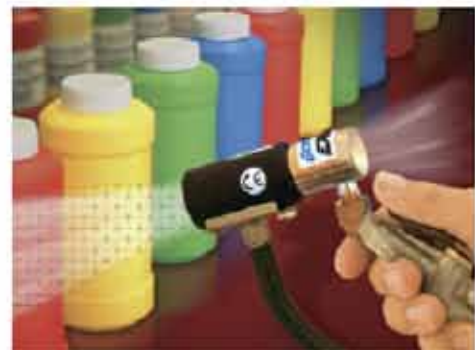
The Model 8293 Gen4 Ion Air Gun neutralizes and cleans plastic bottles prior to labeling.