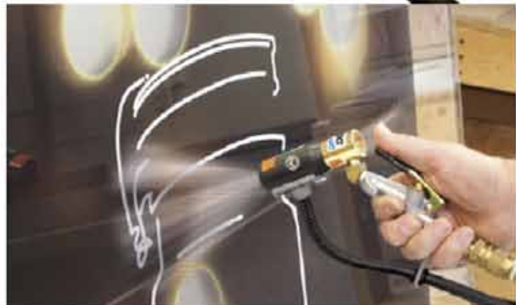
The Model 8293 Gen4 Ion Air Gun cleaning artwork and glass prior to framing.