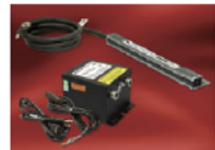
Model 8006 6" (152mm) Gen4 Ionizing Bar and Model 7960 Gen4 Power Supply.

Special length Gen4 Ionizing Bars up to 119" (3.02m) are available. Please contact our factory.