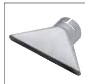
Item No. 4022 Wide slot nozzle 150 x 10