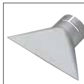
Item No. 4021 Wide slot nozzle 150 x 1