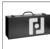
Item No. 7012 Metal case