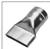
Item No. 4030 Wide slot nozzle 70 x 10 mm