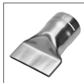
Item No. 4031 Wide slot nozzle 70 x 4 mm